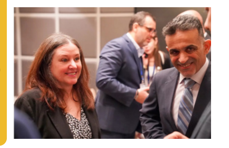
Co-op Development... Global

The International Labour Organization (ILO) and the Jordanian Cooperative Corporation (JCC) have entered a three-year agreement to enhance the cooperative sector in Jordan. Backed by Jordan's government, the initiative includes training programs, digital tools, and updated governance structures aimed at strengthening cooperatives, particularly in agriculture. These efforts build on prior achievements, such as the Cooperative Development Fund and updated legislation, to foster sustainable development.