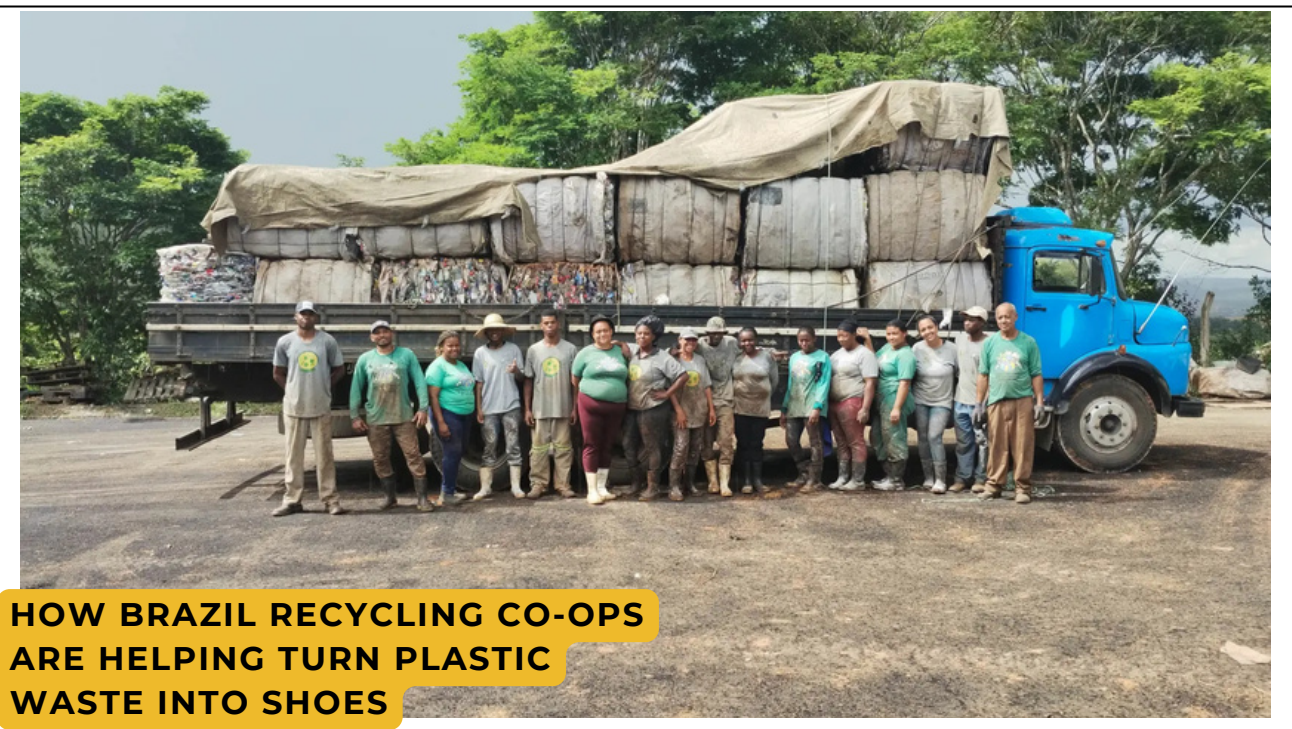
Worker Co-op Impact... Global