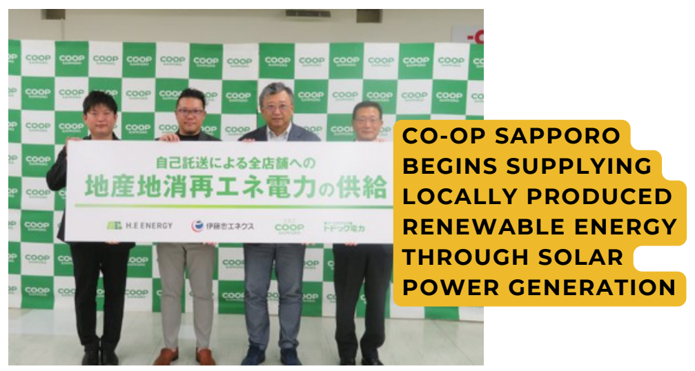
Consumer Co-op Development...Global

Sapporo is advancing sustainable energy in Hokkaido by constructing up to 200 off-site power plants, with 33 solar These currently operational. facilities, including the first Mizuho Power Plant, supply 19 GWh annually to stores, covering 14.13% of their energy needs and CO2 reducina emissions bν approximately 5,900 tons yearly. By repurposing unused land, this initiative minimizes environmental impact while enhancing local energy self-sufficiency.