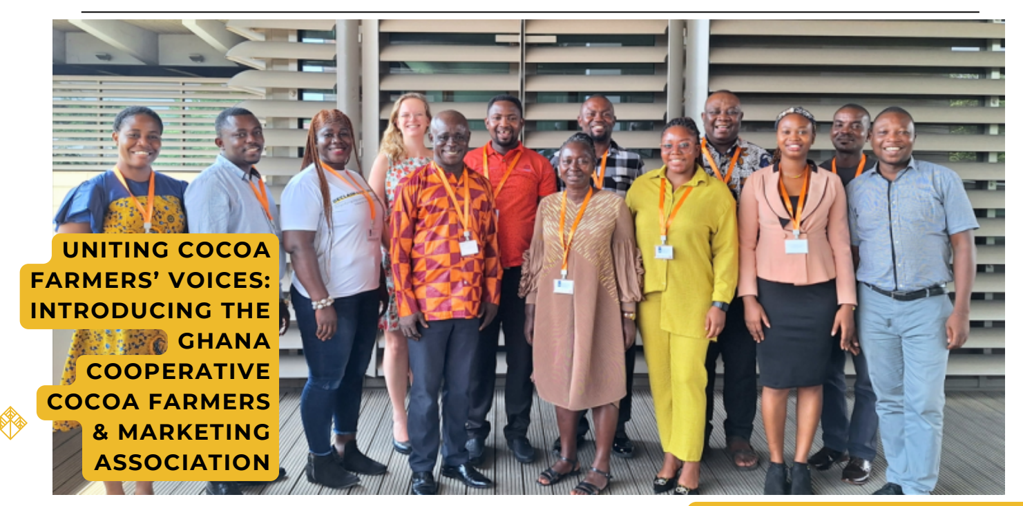
Agri- Co-ops Development...Ghana, Africa

Smallholder cocoa farmers in Ghana now have a unified voice through the newly established Ghana Cooperative Cocoa Farmers and Marketing Association. This umbrella body, comprising 75 cooperative unions from nine cocoa-growing regions, aims to enhance farmers' representation in decision-making processes at local, national, and international levels. Facilitated by Solidaridad under the RECLAIM Sustainability! programme, the association is expected to strengthen advocacy efforts on critical issues such as stable pricing, land rights, and government interventions to improve farmers' livelihoods.